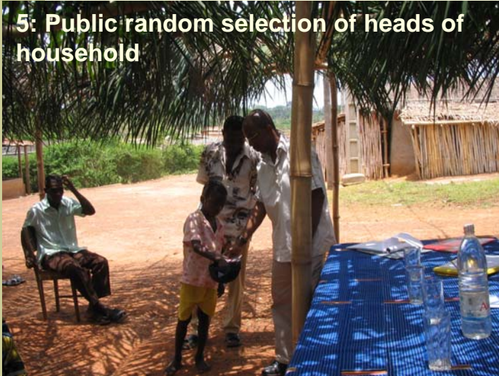
5: Public random selection of heads of household