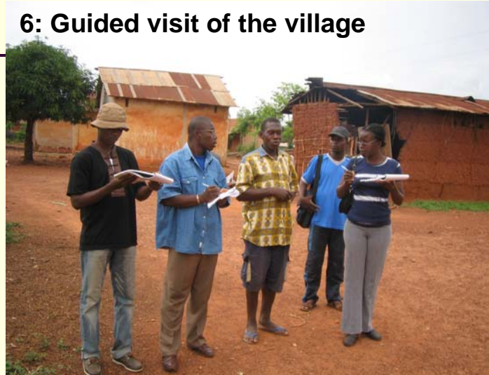
6: Guided visit of the village