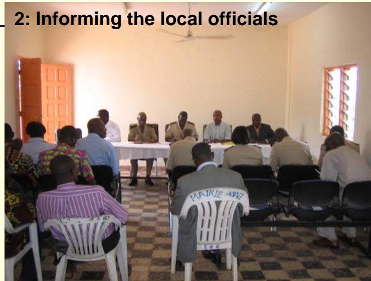
2: Informing the local officials