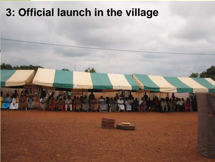
3: Official launch in the village