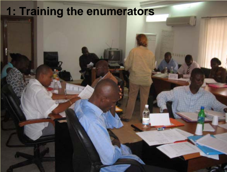
1: Training the enumerators