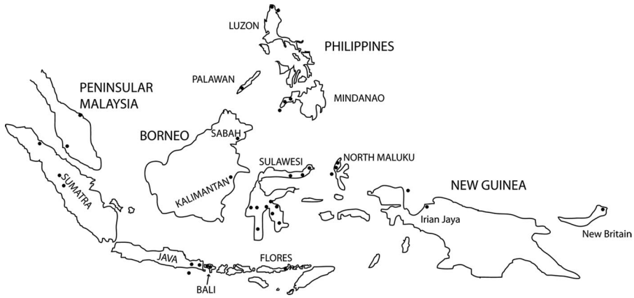
Fig. 1. Collecting sites for C. cramerella in the Malay Archipelago and New Guinea. Black circles indicate approximate sampling sites; circles that seem to be placed in the water represent sites on offshore islands too small to detail on this map.

and quality discounts ( \approx 20\% of international prices) due to C. cramerella (Chisholm et al. 2006). In contrast to Indonesia, Malaysia is not among the world's top producers of cocoa beans (it accounts for <1\% of world production), but it is a major cocoa processor, with estimated 2006 export earnings from cocoa beans and cocoa products of \approx \$600 million (Malaysian Cocoa Board 2008) and inconsistent bean quality due to C. cramerella has a severe impact on the processing industry. C. cramerella has only recently emerged as a threat in Papua New Guinea, where cacao is the second most important export crop after coffee, and it is now viewed as a potentially severe threat to cocoa production in Papua New Guinea.