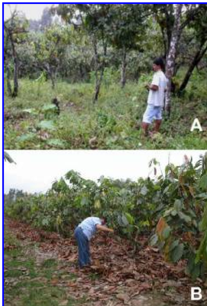
Fig. 2. Cacao plantation management has a profound impact on diseases and the ease with which control measures are applied. In these examples from Ecuador, A , sanitation (removal of diseased pods) is not practiced in a poorly managed farm and tree height makes application of biological and chemical treatments difficult and less effective than is possible in B , a well-managed farm where canopy management and pod sanitation are utilized.

The experience gained from these public-private partnerships, although in their infancy, has been beneficial for both the chocolate industry and the national research centers in cacao-growing countries. On-site presence and networking, backed by broad technical capabilities of both the public and private entities, has allowed for rapid implementation of project results. This should help the flow of research and IPM technology to producers and