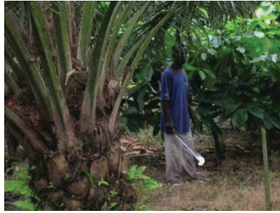
A farmer holding a cutlass

For instance, African farmers use simple tools like machetes (cutlasses), hoes, axes etc., to clear small areas of land and leave the rest of the land to serve as habitats for wildlife. Farm animals may be allowed to graze freely in the fields after harvest or before land preparation to improve soil fertility. Sometimes farmers develop local crop varieties that produce good yields.