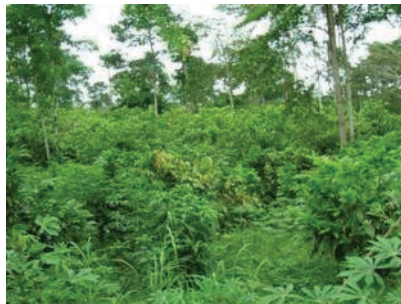
A cocoa farm with different plant species

Agroforestry is a land-use system in which trees, shrubs, palms and bamboos are deliberately planted together with agricultural crops or on grazing land. For example, farmers in most parts of Africa, keep a number of forest tree species, fruit trees and shrubs on their farms. These trees provide fruit, fuel and fodder, give shelter to birds and animals, improve soil fertility and maintain the general ecosystem of the farm. A shaded cocoa farm for example supports up to 180 species of birds that help control insect pests and disperse seeds.