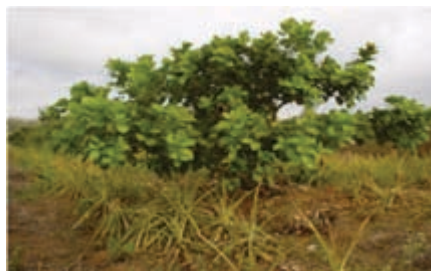
Alley cropping of a tree crop with an arable crop

Some farmers plant two or more crops on the same piece of land. By so doing they maximize available land space and this helps to reduce soil erosion and increase the different kinds of plants on the land. When farmers allow some crops to remain on the land after others are harvested, soil erosion is checked. Erosion can damage the quality of rivers, streams and lakes through deposits of sediments. It can also damage the places where fishes lay and hatch eggs.