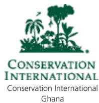
Conservation International Ghana