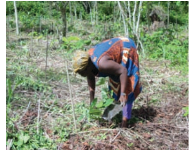
A woman planting cocoa seed

Everything in the natural world is connected – living and non-living. Every species affects the lives of those around it. An ecosystem is a community of living and non-living things that interact and affect one another. It has no particular size - it can be as large as a desert or a lake or as small as a tree or a puddle.