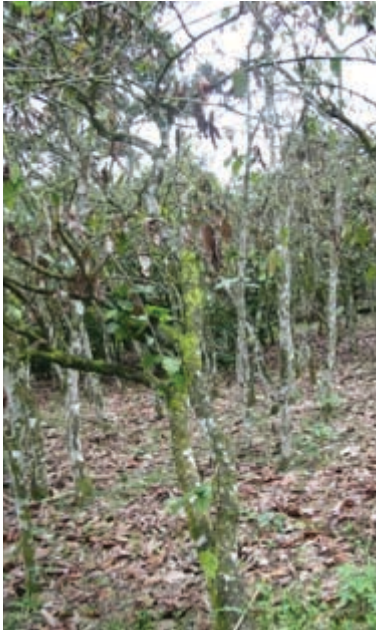
Pest infested cocoa farm

When crops and animals are protected against these harsh weather conditions, yield is increased and losses reduced. Farmers influence microclimate by retaining and planting trees which reduce temperature, wind speed, evaporation and direct exposure to sunlight, and intercept rain. Farmers also use mulch to reduce excessive heat from the sun on soil surfaces and reduce soil moisture losses.