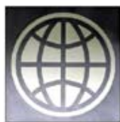
The World Bank East Nimba Nature Reserve (ENNR)