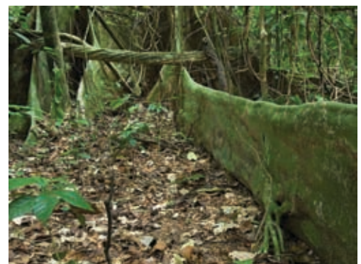
Buttress roots of tropical tree

Wherever there is life, there is biodiversity. It exists in the largest cities and your own farm and backyard. Even where humans have difficulties surviving such as in the frozen Arctic or dry deserts areas, other species live. Tropical habitats contain a large number of species and the relationship between the species is complex. Other habitats