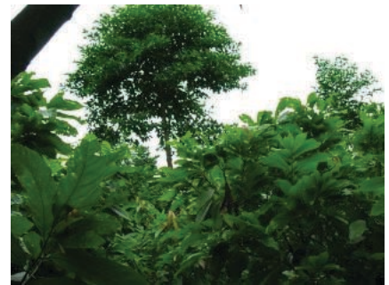
A young IPM cocoa farm