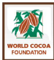
World Cocoa Foundation