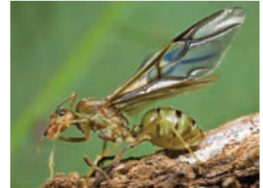
Weaver ant ( Oecophylla longinoda )

The word biodiversity is the short form of the term 'biological diversity' . Biodiversity is the variety of all living things on Earth. This includes the millions of species (people too) that live on land, freshwater systems and oceans. It also includes the tiny organisms that we can see only with a microscope as well as fungi, plants, the trees, ants, beetles, butterflies, birds and the large animals (elephants, whales, bears, etc).