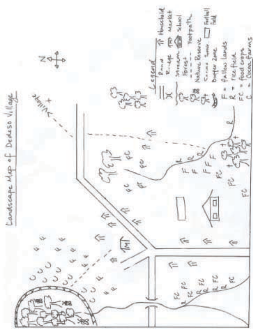
Figure 1: An example of a landscape map