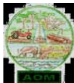
Ministry of Agriculture Liberia